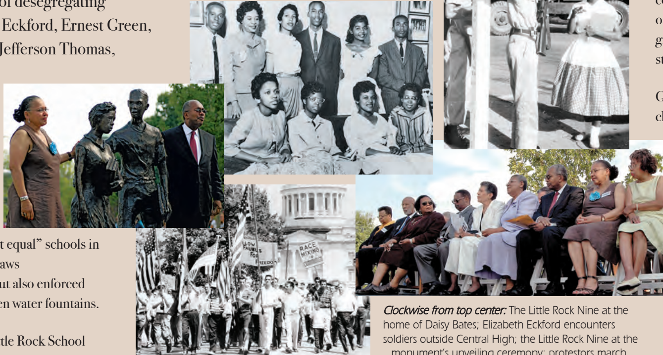
Clockwise from top center: The Little Rock Nine at the home of Daisy Bates; Elizabeth Eckford encounters soldiers outside Central High; the Little Rock Nine at the monument's unveiling ceremony; protestors march down Capitol Avenue; Gloria Ray Karlmark and Ernest Green pose with their bronze casts.

The Little Rock Nine: Elizabeth Eckford, Terrence Roberts, Melba Pattillo, Thelma Mothershed, Jefferson Thomas, Minnijean Brown, Carlotta Walls, Gloria Ray and Ernest Green